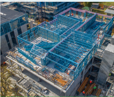
Pryor Street, Eltham