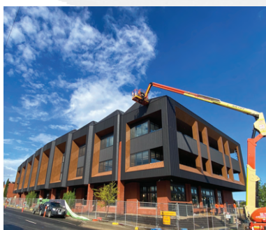
Morwell Gov Hub