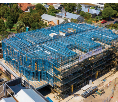
Bowlers Ave, Geelong