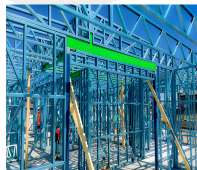
Brightly Blvd, Truganina