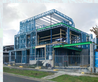
Vida St, Aberfeldie