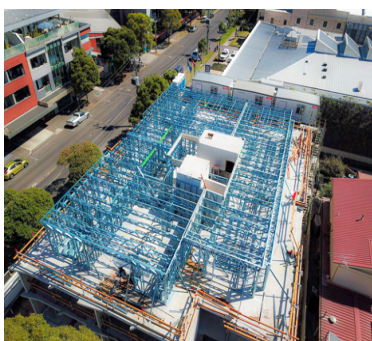
Abbott St, Sandringham