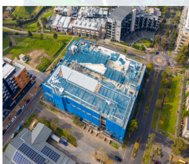
Edgewater Blvd, Maribyrnong