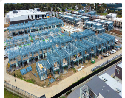
Cheltenham Rd, Keysborough