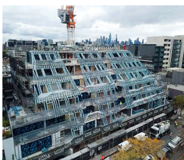
Grattan Street, Prahan