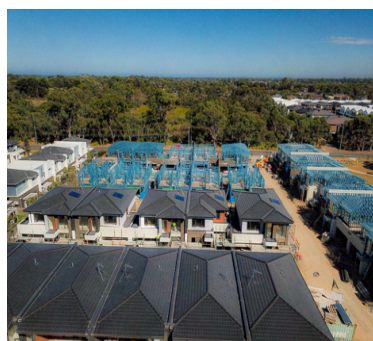
Chapel Rd, Keysborough