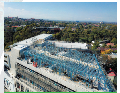
St Georges Rd, Fitzroy North