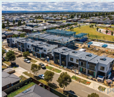
McCormick Rise, Cranbourne